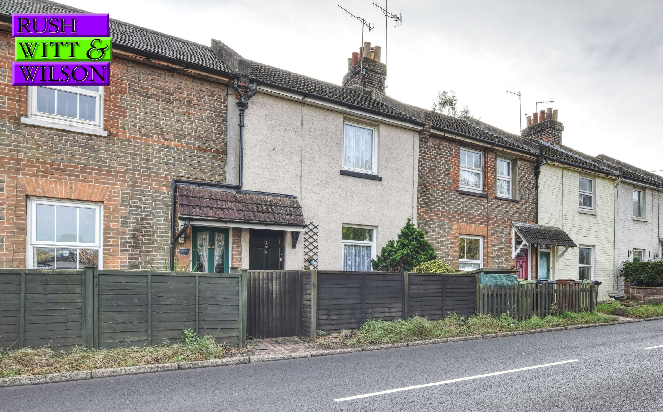
5 St Marys Cottage Ninfield Road, Bexhill-On-Sea, East Sussex TN39 5DE £235,000